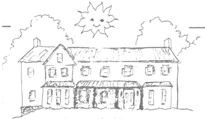
Sunnyside House -